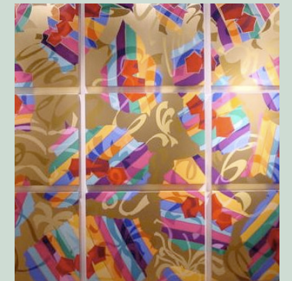
OPPOSITE: ODE TO AN EMERALD ISLE (DETAIL), ENAMEL ON ALUMINUM